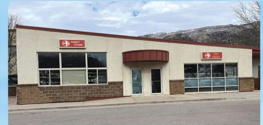
New LIFT-UP Headquarters

The need in our region is increasing, and our guest numbers have grown exponentially. We need YOUR help to meet this growing demand and feed our neighbors.